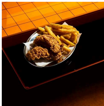
Wings & Drumettes $8 OTC $10.50 DEL