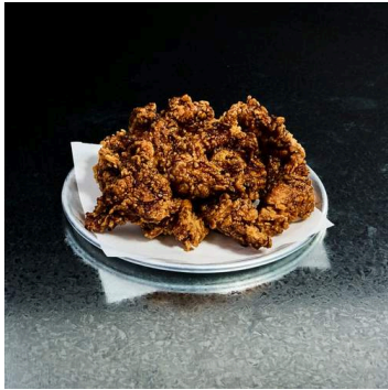
Garlic Soy Popcorn