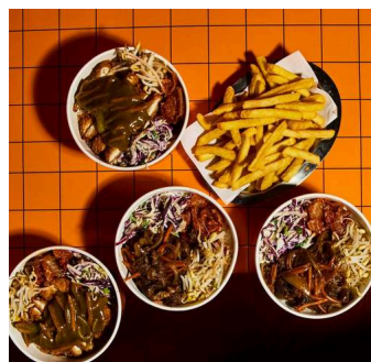
Family Bowls Feast $59 OTC $76 DEL