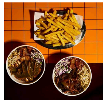
Bowl Lovers $36 OTC $44 DEL