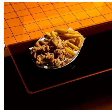
Popcorn Chicken $8 OTC $10.50 DEL