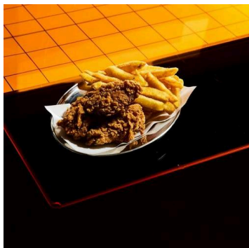
Tenders Snack Pack $8 OTC $10.50 DEL