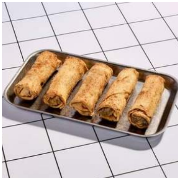
Sweet Apple Spring Rolls