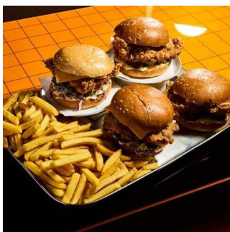
Family Burger Feast $52 OTC $72 DEL