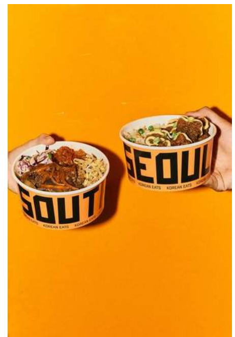
Social Image Examples