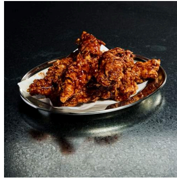
Korean BBQ Tenders